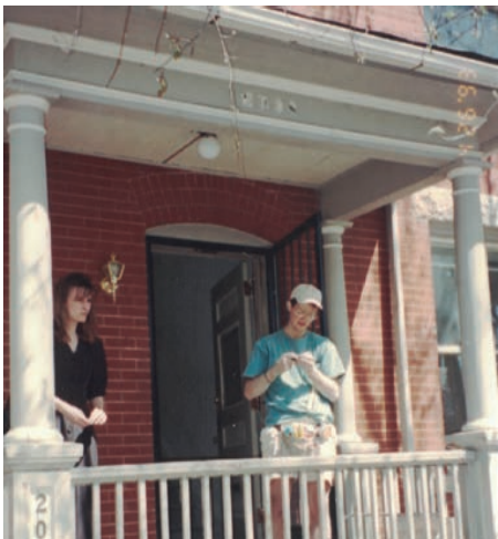
My First Rehab Project

So, don't hesitate to ask for help with any real estate matter. I am here to assist you in setting your sails for a more enjoyable and profitable real estate life here on our Isle of Hope or wherever you may go!