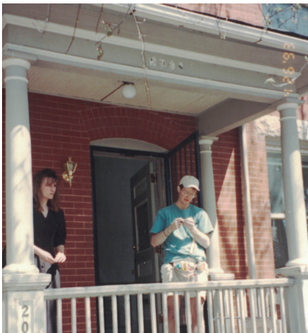
My First Rehab Project

So, don't hesitate to ask for help with any real estate matter. I am here to assist you in setting your sails for a more enjoyable and profitable real estate life here on our Isle of Hope or wherever you may go!