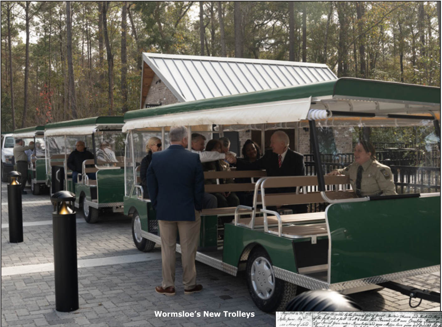
Wormsloe's New Trolleys