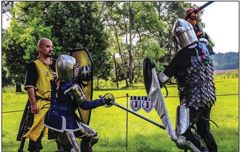
The Shire of Fort Castle demonstrates armored combat

Next, head to the dance area to take in the ScotDance USA Southeast Regional Highland