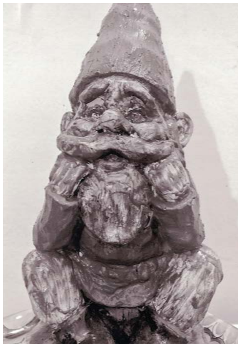
A fine specimen "Dumble" is. That's incontestable!

The woodcarver was skilled. That's indisputable!