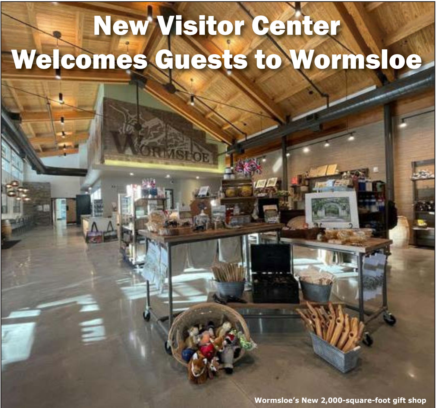
Wormsloe's New 2,000-square-foot gift shop