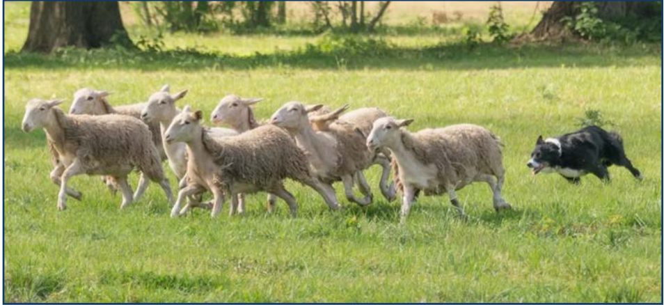
A Border Collie Herds Sheep During the Savannah Scottish Games