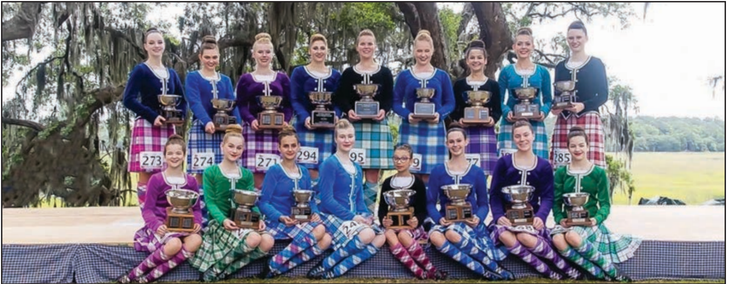
ScotDance Southeast Regional Highland Dance Championships