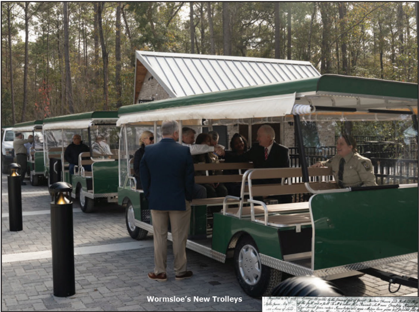
Wormsloe's New Trolleys