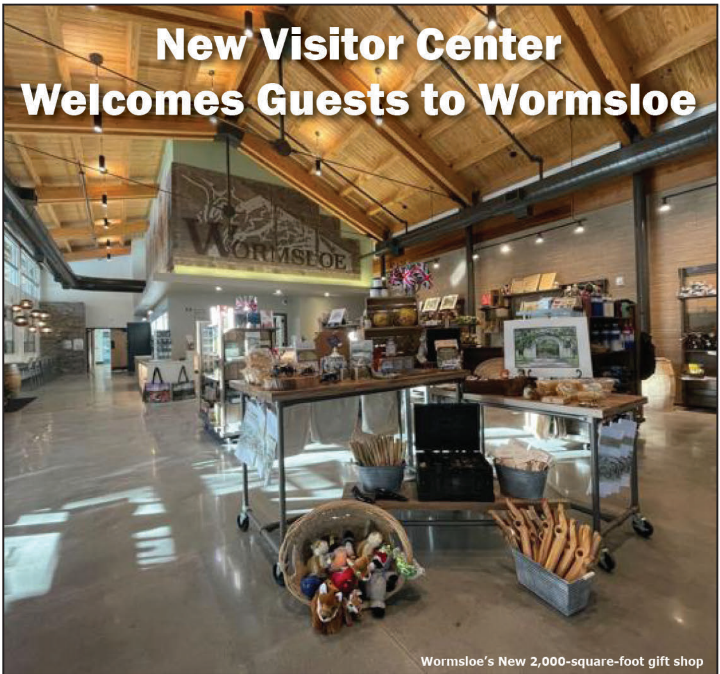
Wormsloe's New 2,000-square-foot gift shop