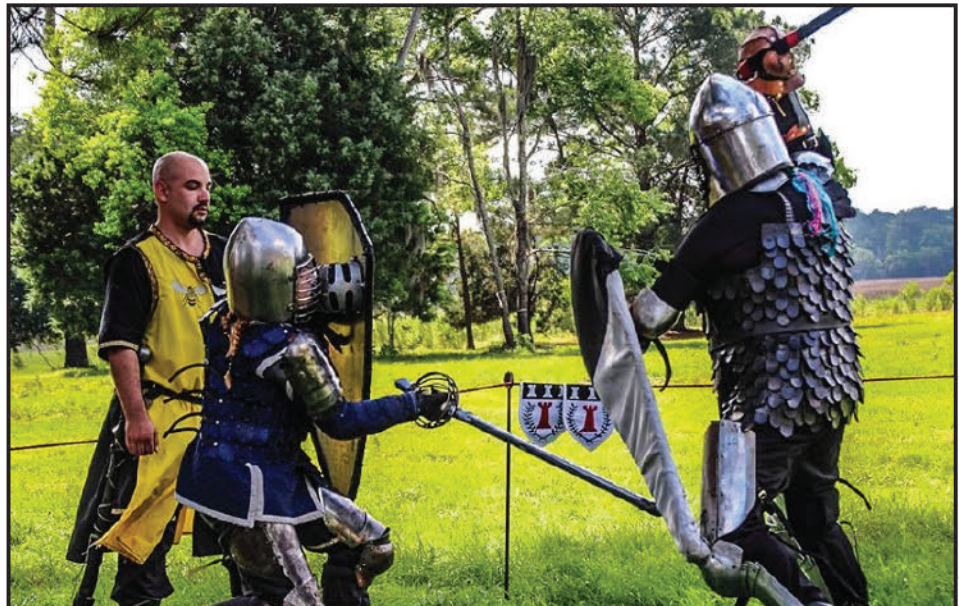
The Shire of Fort Castle demonstrates armored combat

Next, head to the dance area to take in the ScotDance USA Southeast Regional Highland