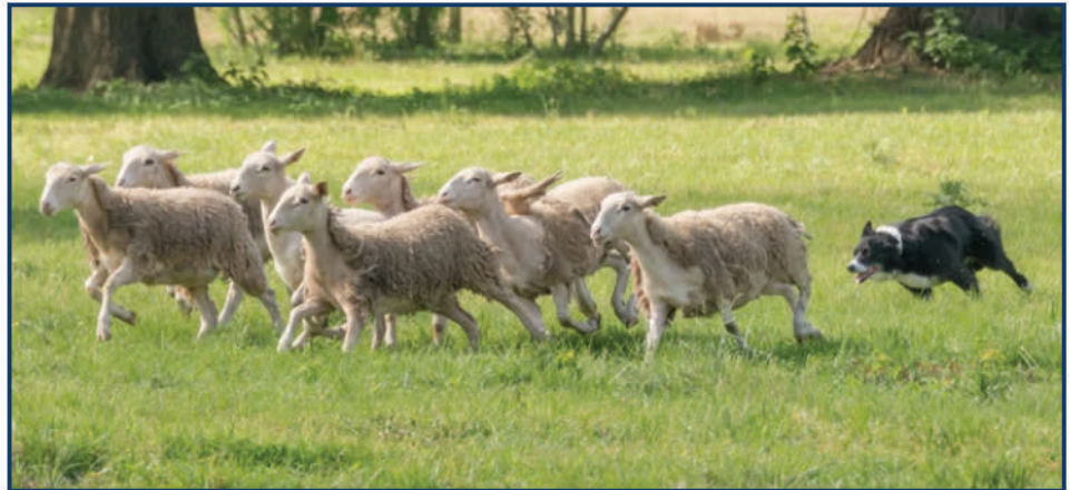
A Border Collie Herds Sheep During the Savannah Scottish Games