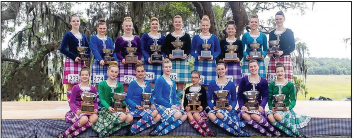
ScotDance Southeast Regional Highland Dance Championships