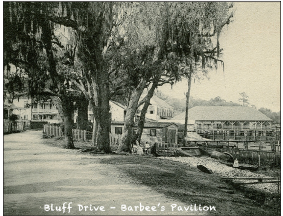
Bluff Drive, Barbee's Pavilion