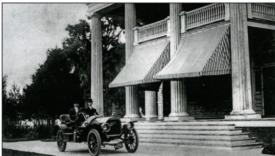
The Teidemann house which burned to the ground in 1933.