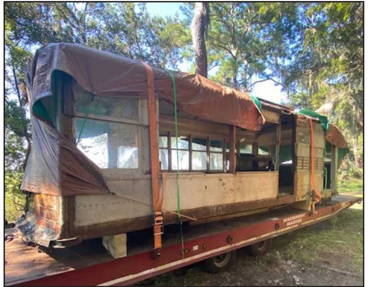
IOHHA Plans to Restore IOH's Birney Safety Streetcar

Just go to www.iohha.com and sign up. Memberships start at $50 per household