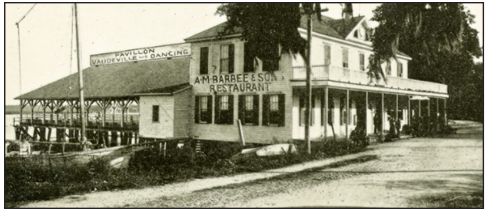
World famous Barbee's Restaurant, Pavilion, Crab/Oyster factory & Turtle farm on Bluff Drive. The original building burned down in 1902, and this building was built immediately thereafter.