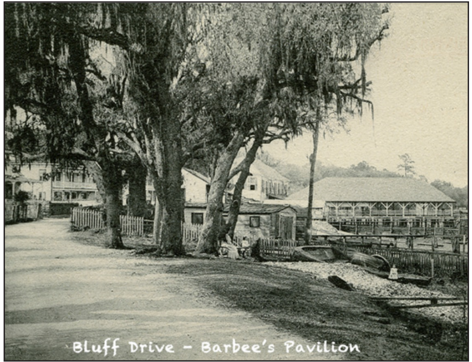
Bluff Drive, Barbee's Pavilion