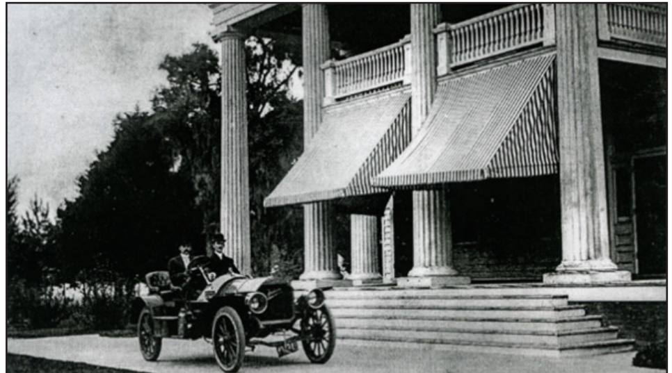
The Teidemann house which burned to the ground in 1933.