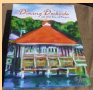
Dining Dockside on the Isle of Hope